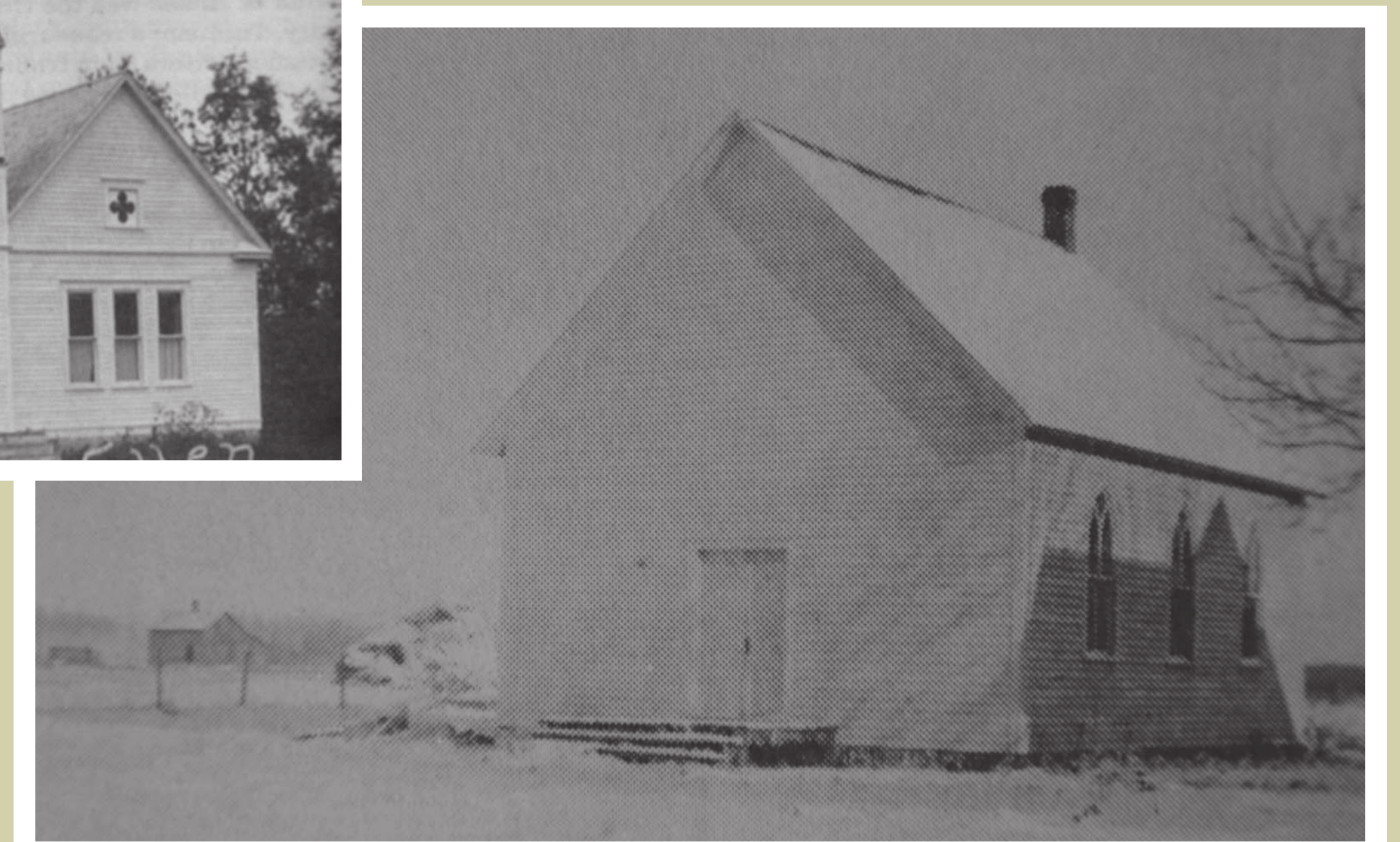
Swedish Church built in 1906 on the northwest corner of the lumberyard block. The church of the Newfolden Mission Society in 1905. Above Left: Newfolden Mission Society Church in 1905.