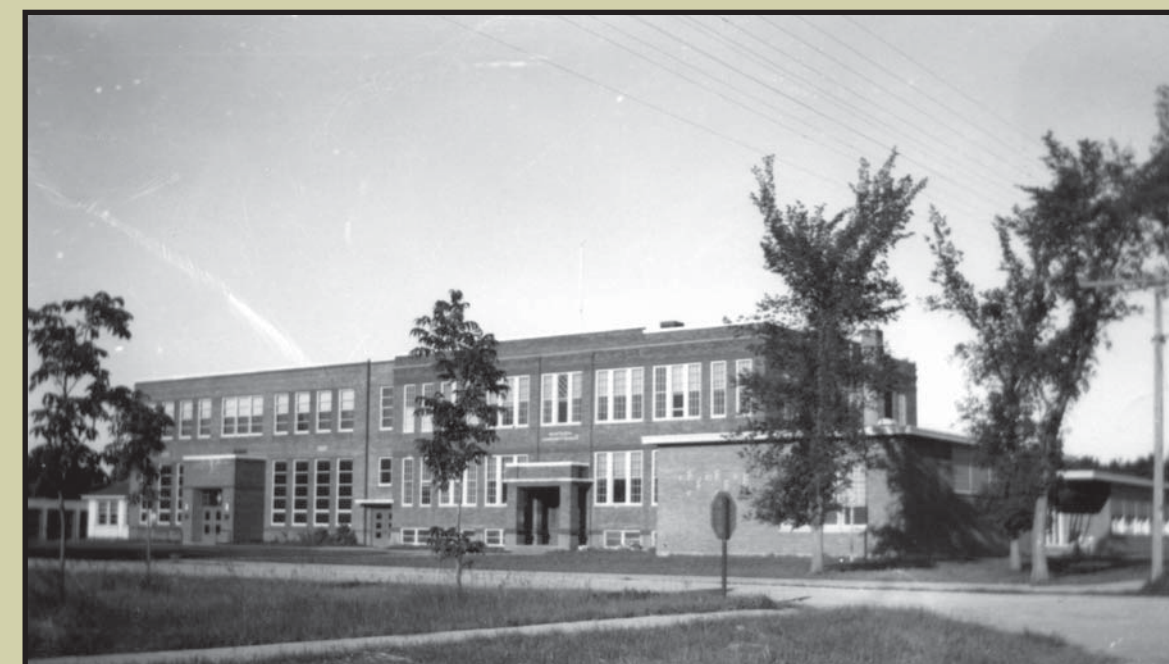
Elementary School in the mid 1950s.