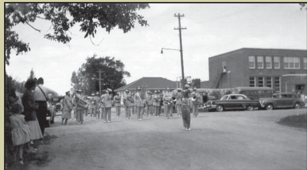
Newfolden High School Band. 1954.