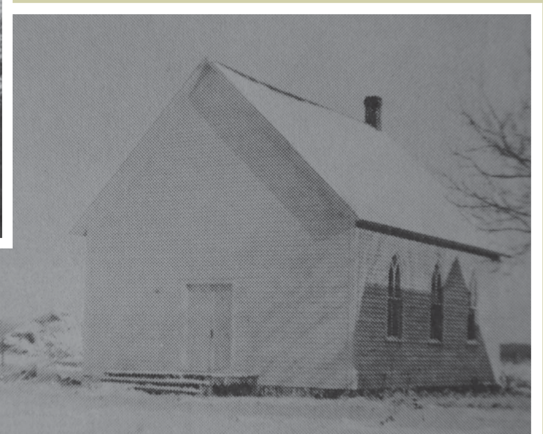
Swedish Church built in 1906 on the northwest corner of the lumberyard block. The church of the Newfolden Mission Society in 1905. Above Left: Newfolden Mission Society Church in 1905.